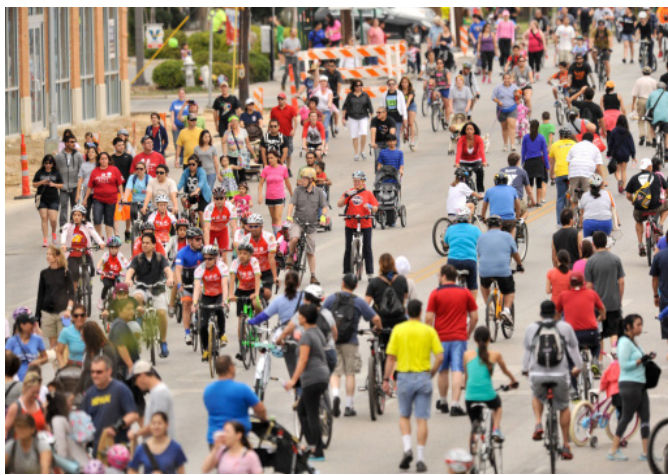
Scolvia attendees have the benefit of turning major streets into a safe place for people to exercise and play twice a year.

In 2011, the City of San Antonio identified its vision for a sustainable future through the SA 2020 process. This sustainability planning process is designed to create a roadmap to get to that vision. Throughout the planning process we will be asking for your help in determining sustainability goals and strategies, prioritizing strategies and developing steps to implement these strategies.